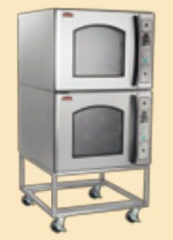
△ Double oven