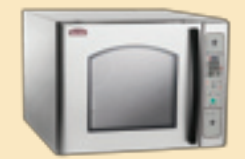
△ Single oven