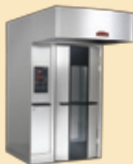
△ Rotating Single Rack Oven OV500