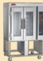
△ Mini Rotating Rack Oven with 12-Pan Stand OV300