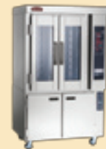
△ Mini Rotating Rack Oven with Proofing Cabinet Stand OV300