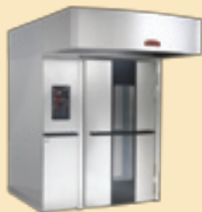
△ Rotating Double Rack Oven OV500