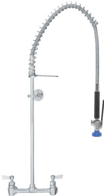
Water Conservation Comparison- Industry Standard to Fisher Ultra-Spray™ Valves