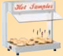
Model GRHW-.5P with blank translucent sign and backlit sign holder