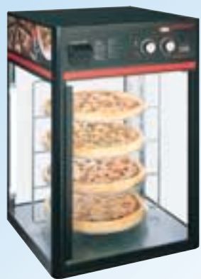
Model FSdT-1 with accessory pizza pans and decals