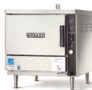
> Hobart HPX3

> This features checklist will help you choose the right Hobart Steamer for your operation.