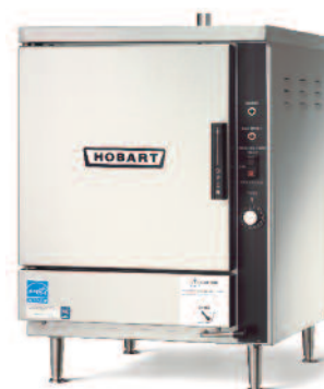
> Hobart HPX5