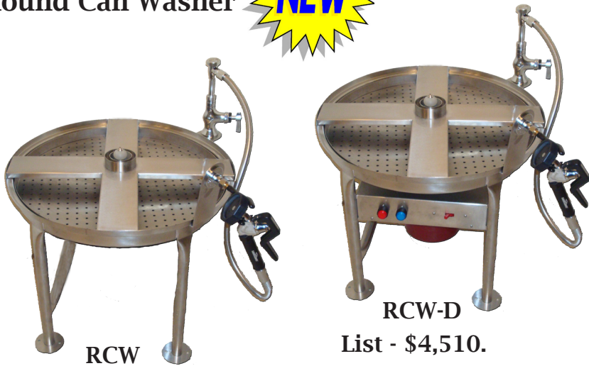
RCW List - $3,050.