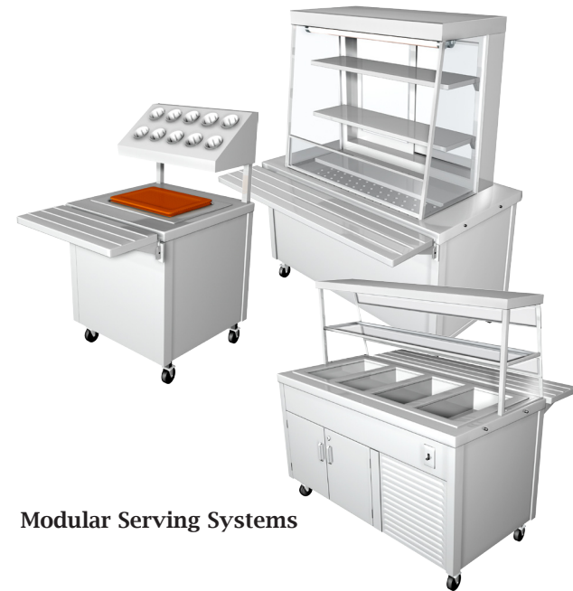
Modular Serving Systems