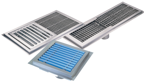
Floor Troughs & Grating