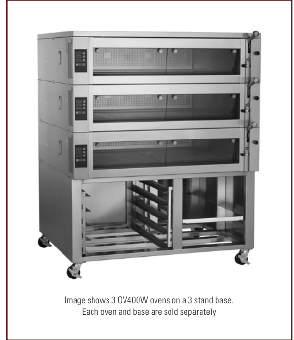
Image shows 3 OV400W ovens on a 3 stand base. Each oven and base are sold separately