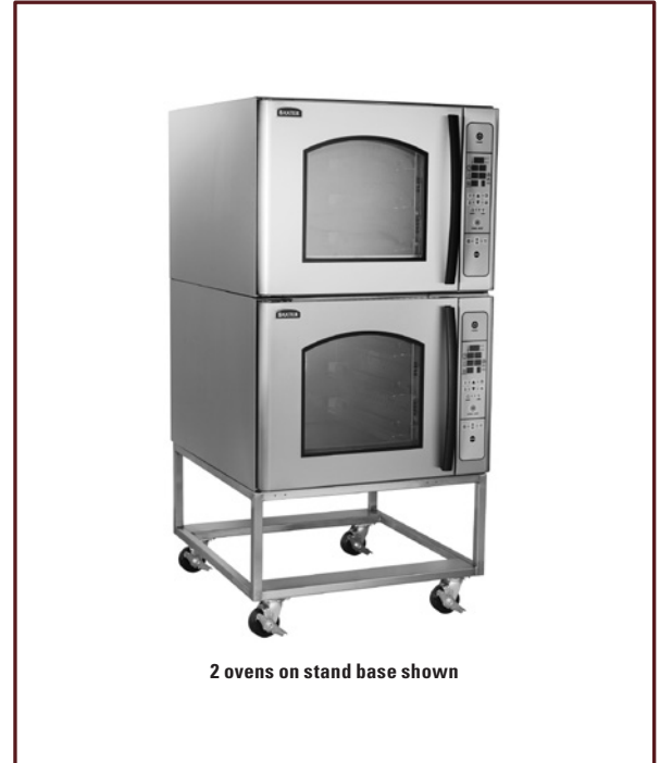
2 ovens on stand base shown