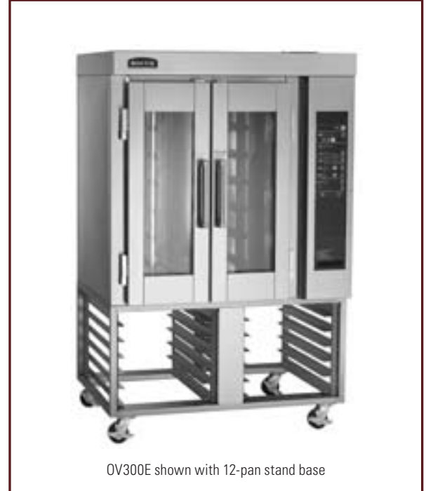
OV300E shown with 12-pan stand base

Note: Capacities based on a standard 18"x26" pan