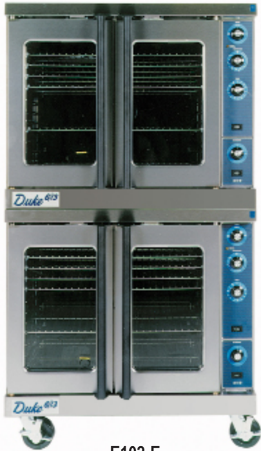
E102-E (Shown w/optional casters)