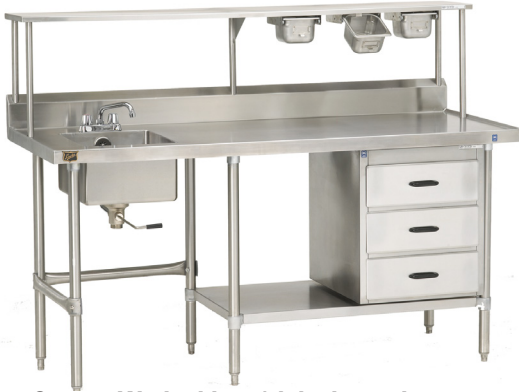
Custom Worktable w/sink, tier or drawers, riser, spice bins