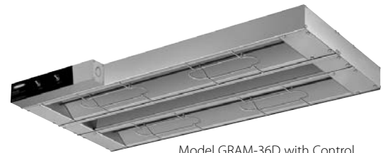
Model GRAM-36D with Control Enclosure with toggles and 3" (76 mm) spacer