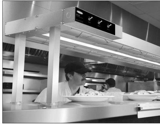
Model GRAML-54D with Control Enclosure with toggles and optional non-adjustable tubular stands