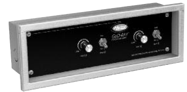
Remote Control Enclosure for Models GRN4-66 and GRN4-72