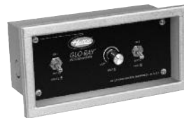
Remote Control Enclosure for Models GRN4L-24 through GRN4L-60