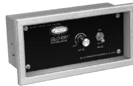
Remote Control Enclosure for Models GRN4-18 through GRN4-60