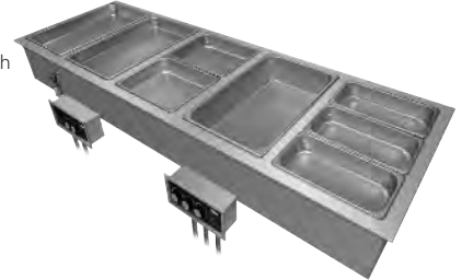
Model HWBI-5MA with accessory food pans