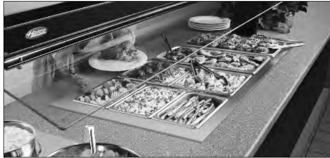
Model HWBI-4MA with accessory food pans

▲ For HWBI-FUL (HWBI-1) and HWBI-FULD (HWBI-1D), see Form No. HWBI-FUL Spec Sheet