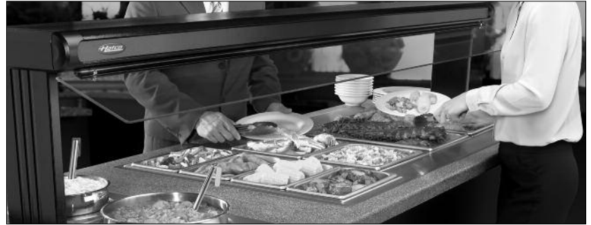
Model HWB-43D with accessory food pans (single unit holding 4 third-size pans)