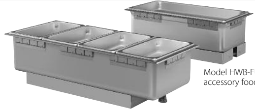
Model HWB-FULD with accessory food pan