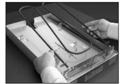
Quick access heating element and thermostat, for easy service