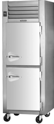
Model RLT126WUT-HHS (shown with optional casters)