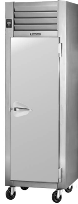
Model RHT132DUT-FHS (shown with optional casters)