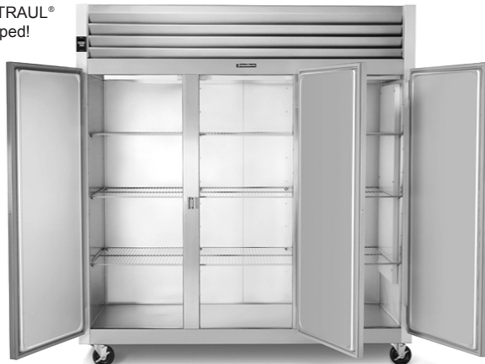
Model AHT332NUT-FHS (shown with optional casters)