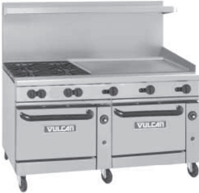
Model 60-SC-4B-36G-N (shown with optional casters)