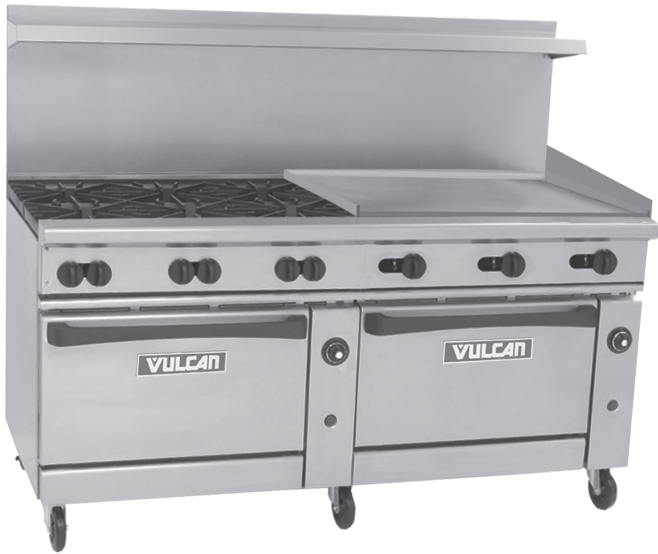
Model 72-SC-6B-36G-N (shown with optional casters)