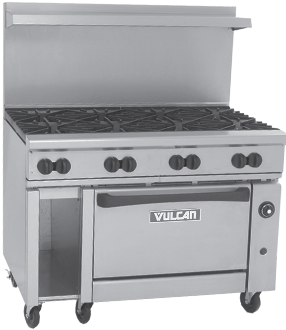
Model 48-S-8B-N (shown with optional casters)