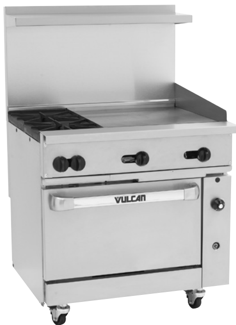
Model 36S-2B-24G-N (shown with optional casters)