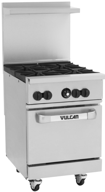
Model 24S-4B-N (shown with optional casters)