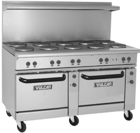
Model EV60-SS10FP-208 shown with optional casters