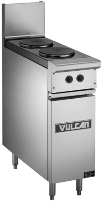
Model EV12-2FP-208 shown with adjustable legs