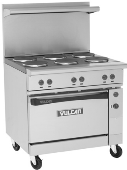
Model EV36-S-6FP-208 shown with optional casters