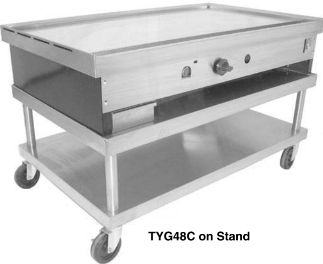
TYG48C on Stand