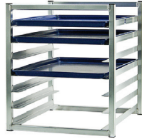
1610 | 1/2-Size Insert Rack Full size models also available.

Insert Racks are designed for freezer and refrigerator/cooler use and are designed to hold 13" x 18", 14" x 18", and 18" x 26" sheet pans. These racks fit most reach-ins with a 21" clearance.