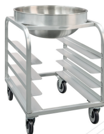
51949 | Mixing Bowl Dolly

Minimize Uncomfortable Working Positions