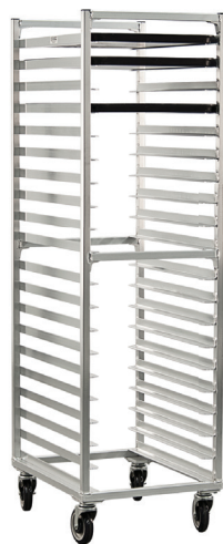
1331 | Bun Pan Rack Heavy Duty

Transport, organize and store a mass amount of product with one unit.