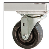
Heavy duty, 4" diameter "Hi-Temp" wheel casters.