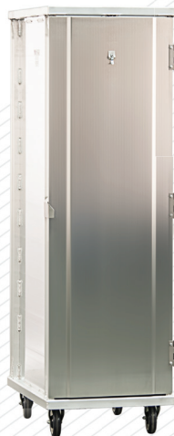
1290 | Enclosed Cabinet