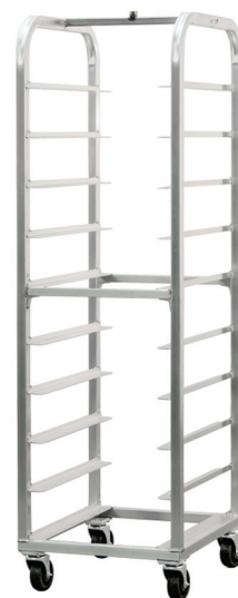
1801A | Oven Rack

This Bulk Sheet Pan Dolly will store and transport up to 140 sheet pans.