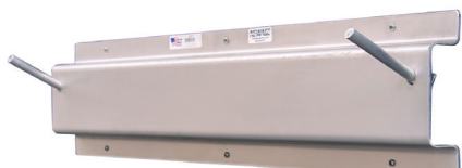
52677 | Wall Mount Mat Rack