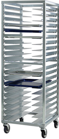
1642 | Stepped-Angle Rack Universal