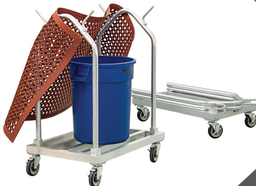
51087 | Mat Cart (Knocked Down)