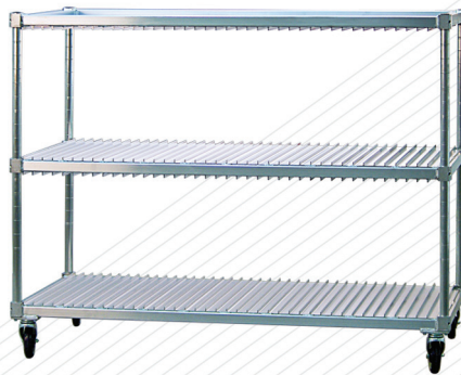
95413 | Adjustable Tray Drying Rack

These Adjustable Tray Drying Racks conveniently stack pans and trays for drying without contact, allowing air to circulate freely for faster drying and to reduce pan-to-pan contamination.