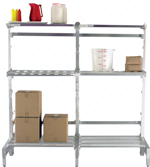
Free-Standing Cantilever Shelving

eliminates the need for shelving replacements due to rusting.