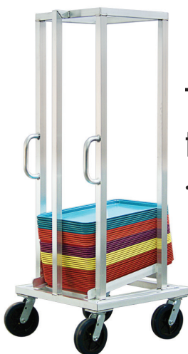
50112 | Bulk Sheet Pan Dolly