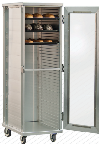
1290CD | Enclosed Cabinet with Clear Door Option