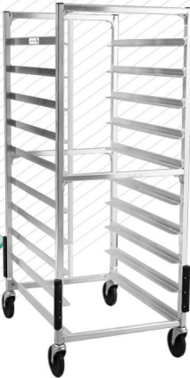
96004 | Room Service Tray Return Cart