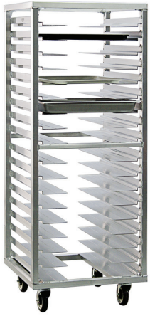
1637 | Stepped-Angle Rack Universal Roll-In

Extremely versatile, these racks are designed to transport a WIDE variety of pans and trays in a WIDE variety of sizes. Extra-wide step angles are welded to the heavy-duty frame giving you the freedom to mix—and-match pans and trays of various sizes on one rack.