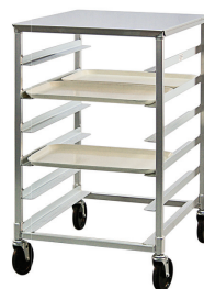
NS834A | 15" x 20" Tray Rack Side Load, Stainless Top