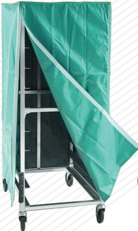
96004C | Room Service Tray Return Cart with Cover

All of these units were designed to hold a high capacity of 15" x 20" trays. Our Tray Return Carts come with an optional "staph check" cover to help protect contents and are equipped with vertical bumpers and pan stops as standard features.