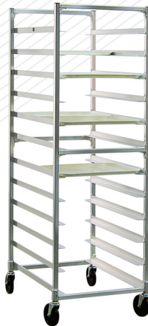
NS833 | 15" x 20" Tray Rack Side Load