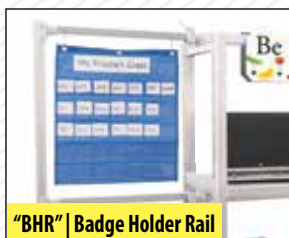
"BHR" | Badge Holder Rail