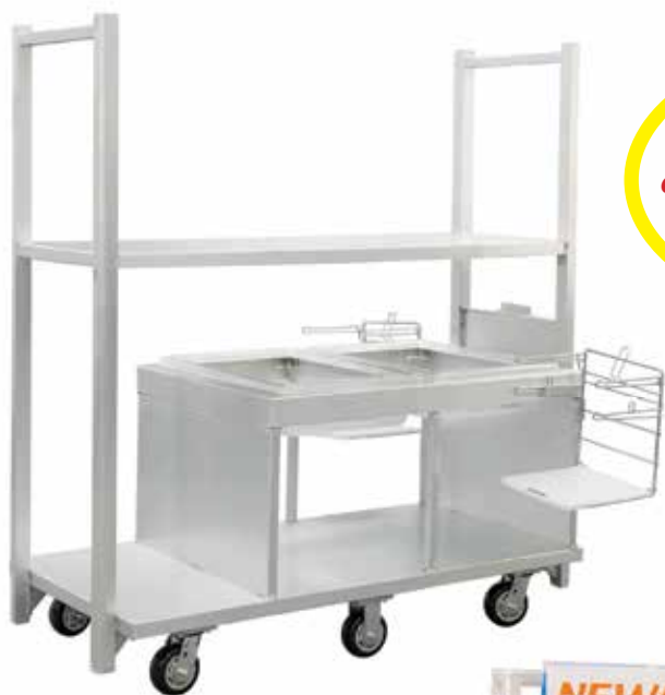
(poly boxes not included)

Putting carts where students congregate reduces social stigmas and increases participation.