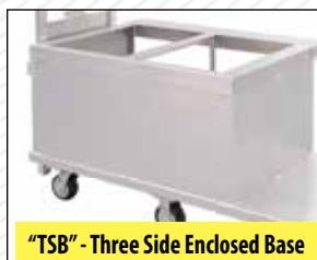
"TSB" - Three Side Enclosed Base