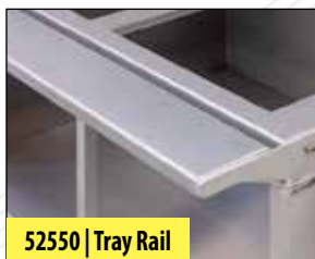
52550 | Tray Rail