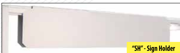
"SH" - Sign Holder

Tray Rail: Folds up for easy maneuvering in hallways and classrooms.