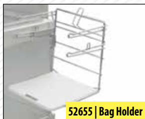
52655 | Bag Holder