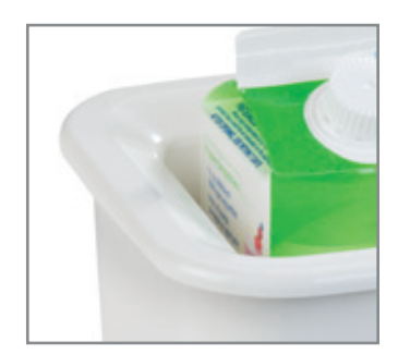
Convenient and Clean No messy, unsanitary ice baths