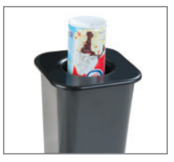
Fast and Efficient Store prep station dairy products in-line for ultra-fast service