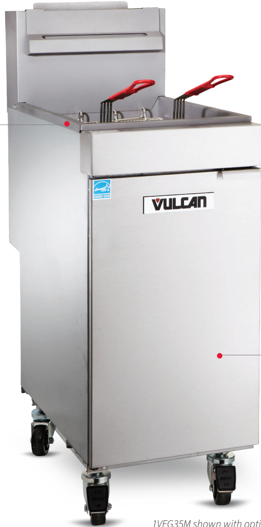
1VEG35M shown with optional accessory casters

A Vulcan product expert will verify the new equipment was installed accurately and is functioning properly — giving you greater peace of mind.