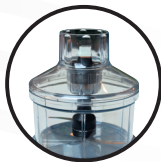
FOOD PROCESSOR BOWL